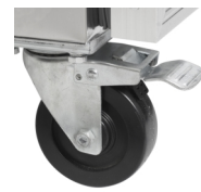
Strong castors as option