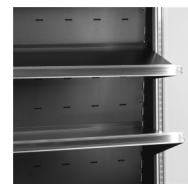
Adjustable shelves with tilting function