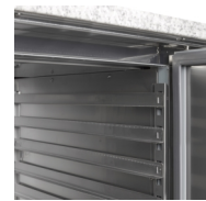
Guides for pizza trays