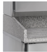
Granite table top