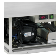
Automatic evaporation of defrost water